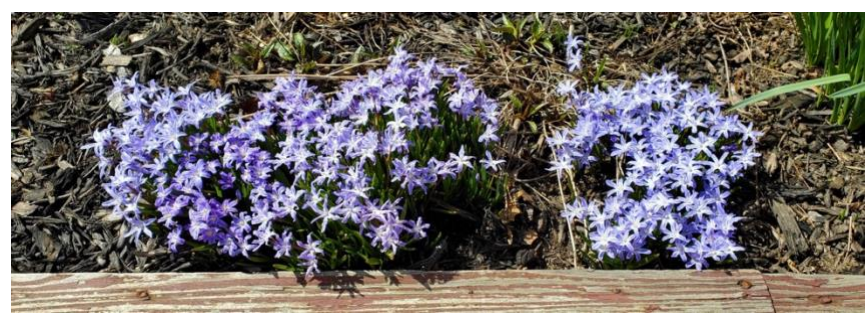
Spring blooms at Immanuel!