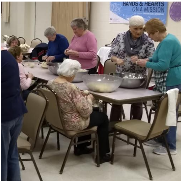
The "potato peeling platoon" getting things ready in the morning.