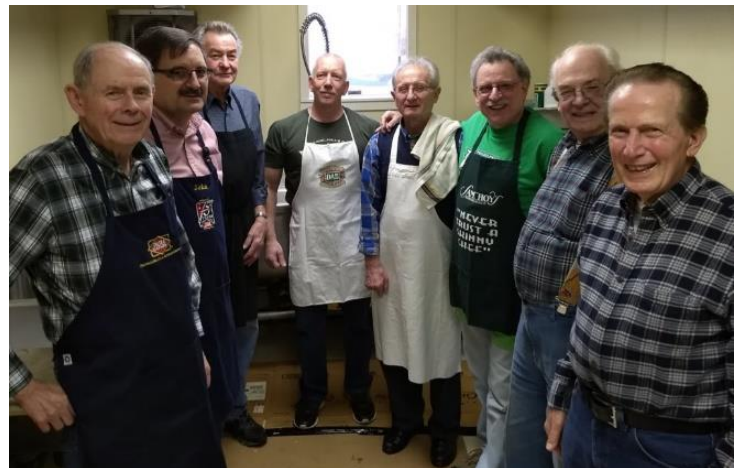
The "dishwashing derwiches" kept the dishes coming.