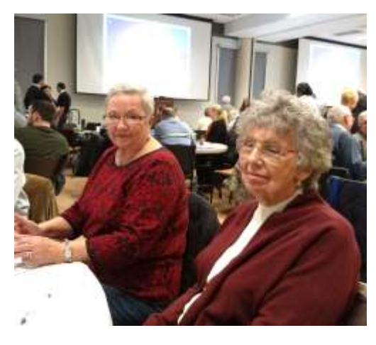
Two of Immanuel's leaders, joined Pastor in attending a leadership conference entitled "Canoeing the Mountains," held at the seminary in Philadelphia.