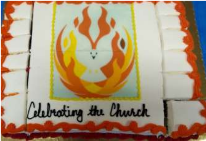
This Pentecost Cake was enjoyed at the congregation picnic on Pentecost Sunday.