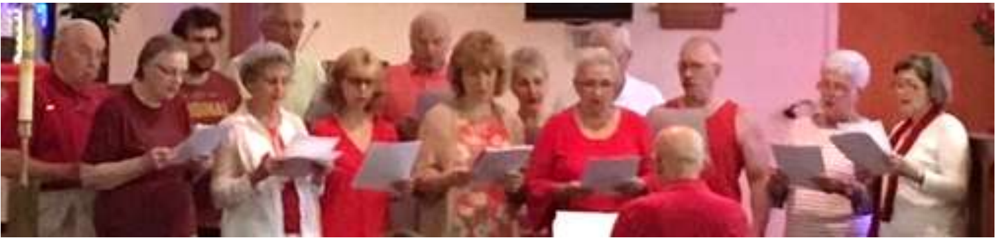
"Choir of the Day"