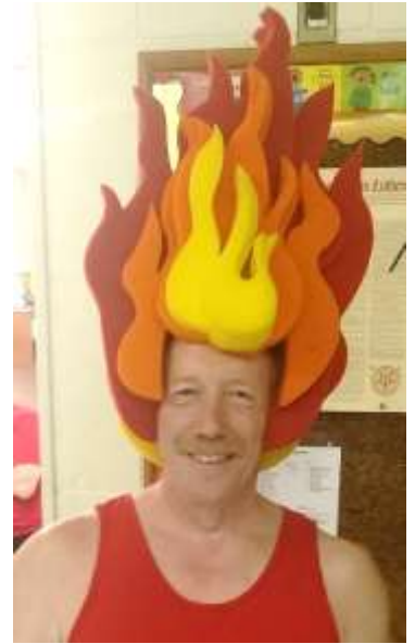
Stew was a good sport and tried out the Pentecost flame hat.