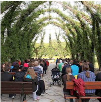
Gottesdienst in der Weidenkirche in Pappelheim