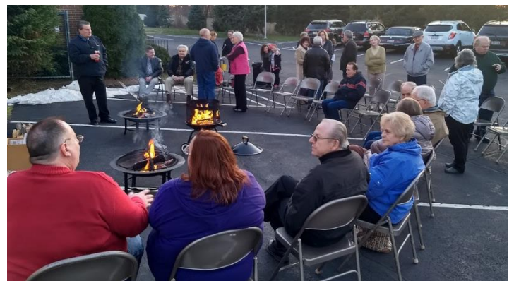
An Easter fire and fellowship preceded the Easter vigil on Easter Saturday, April 30.