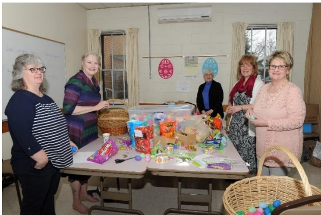
Preparing the eggs for the Easter Egg Hunt held on the Immanuel campus on Saturday, April 30, 2018.