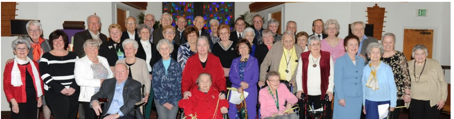
Confirmed members celebrating an anniversary