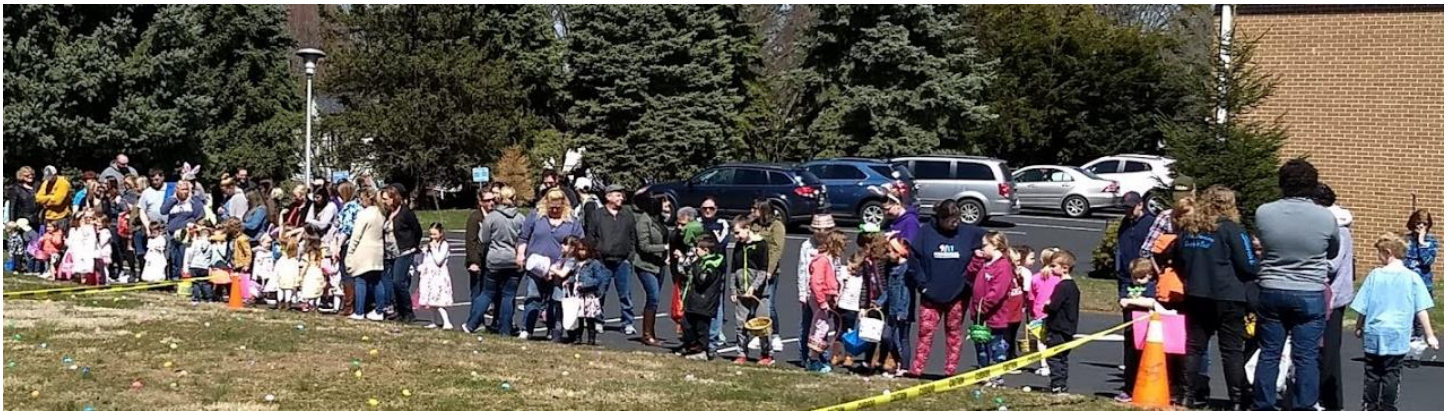
Almost twice as many children as last year lined up for our Easter egg hunt on Easter Saturday.