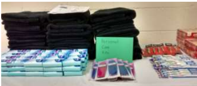
Items for Personal Care Kits