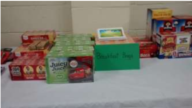
Items for Breakfast Bags