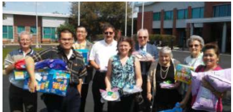
One of the Visiting Teams