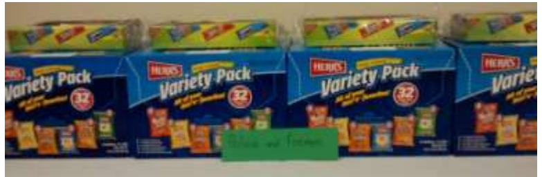
Snacks and Cookies for the Police and Fireman