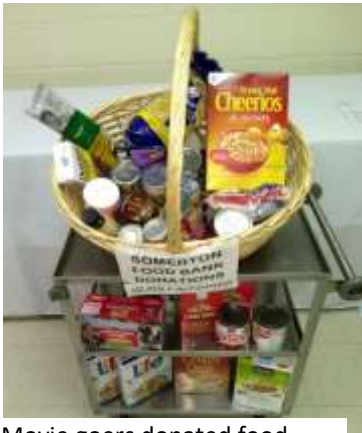
Movie goers donated food items for the Food Bank.