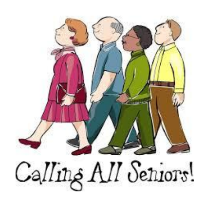
A Thrivent Action Team Event

\underline{https://www.signupgenius.com/go/904044fa9ad28a7fc1-senior}