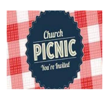
Indoor Picnic June 11 See Page 6

Bingo Night Recap Page 6 Food Bank Support Page 6 Thank You Notes Page 7 Calendar Page 8